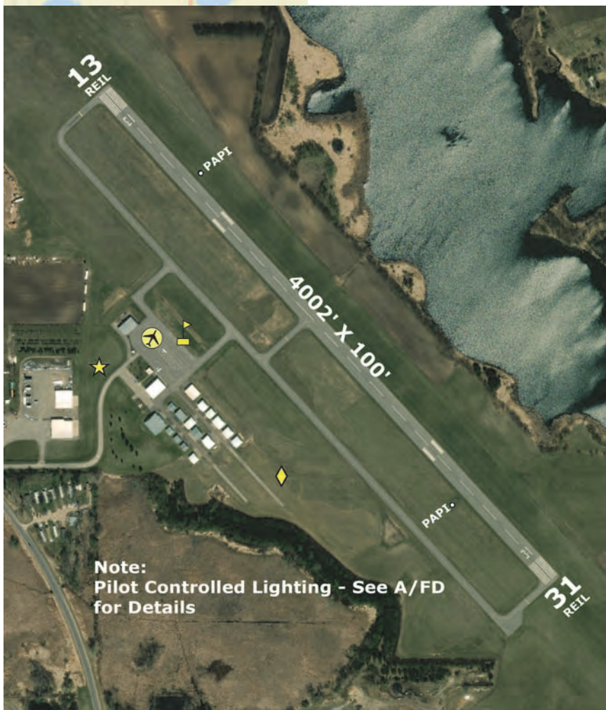
Litchfield Municipal Airport